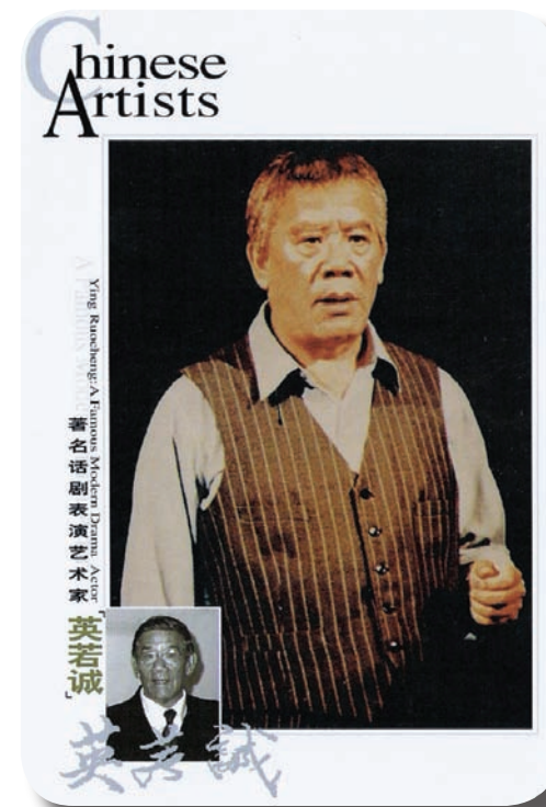
A Chinese postcard honoring Ying Roucheng as "a famous modern drama actor."

Lexington High School; she continued her language study at Wesleyan and Harvard Universities, as well as at Peking University and Fudan University in Shanghai. She explains that in Beijing in 1991 during a technical rehearsal of George Bernard Shaw's Major Barbara (which Ying translated and directed), she requested an introduction and then for two hours "had a chance to talk with and get to know Ying."