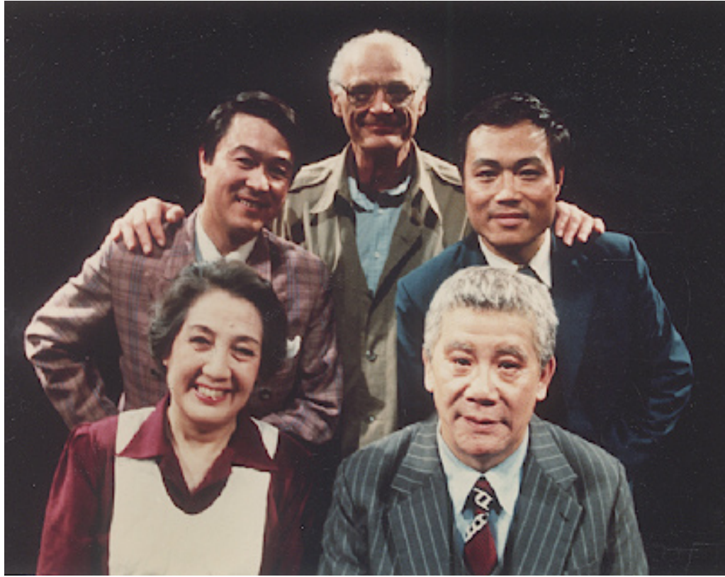
Salesman Cast, 1983.